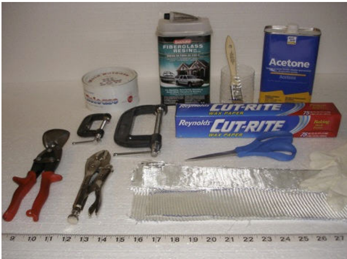
Tools and supplies needed (from left to right):

Why fiberglass landing gear? They're tough, easy to make and won't permanently deform as a result of a hard landing. The same technique can also be used to make high-tech, carbon-fiber landing gear, but you will have to experiment with the number of plies (layers of cloth) to use. The fiberglass gear described works great on profile, trainer and other RC aircraft. You can easily make these in an afternoon or a lazy weekend. All of the needed materials can be found at your local hobby shop and hardware store.